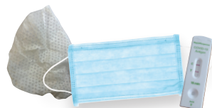
Masks, wipes, rapid test supplies