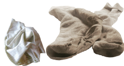
Rags & unusable clothing