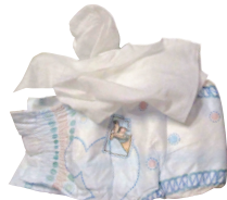
Diapers & diaper wipes