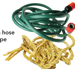
Garden hose & rope