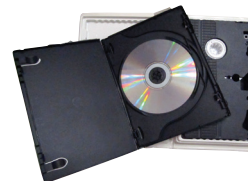
CD/VHS/DVDs & cases