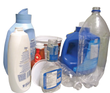
Plastic bottles, jugs, tubs & lids (Empty liquids)