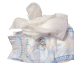
Diapers & diaper wipes