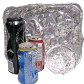
Aluminum cans & plates

Return all eligible liquor, wine, beer containers to the Beer Store for a refund.