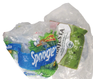
Plastic outer wrap from paper towel, pop, water cases