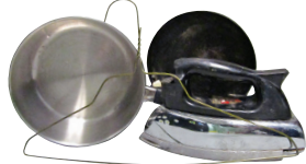
Small scrap metal items - Must fit in your yellow bin - baking sheets, small appliances (i.e. toaster, metal tools, etc., remove & discard cords in garbage, remove batteries for hazardous waste)