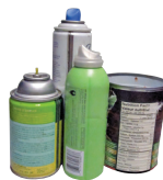
Aerosol (empty) & tin cans