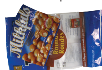
Candy & chip wrappers