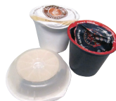
Coffee pods (K-Cups, Tassimo T-discs)