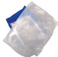
Cereal/cracker box liners & cookie bags